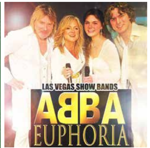
ABBA EUPHORIA March 28 - 7:00 pm