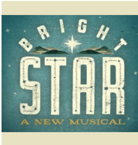
Bright Star March 5th - 15th