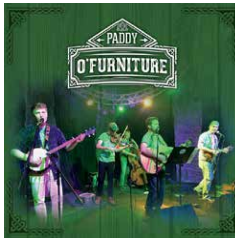
Paddy O'Furniture March 10 - 2pm & 7pm