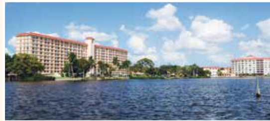
THE POINT PLEASANT NEIGHBORHOOD