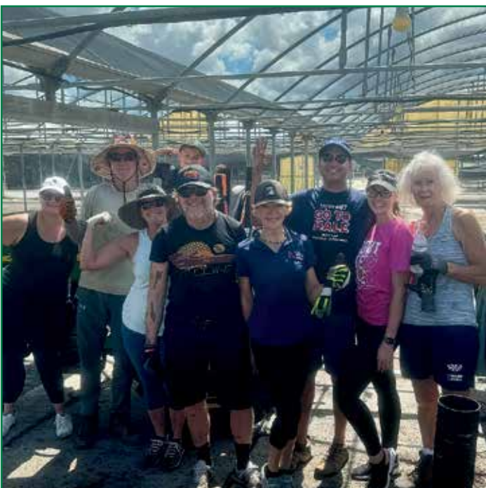
Hale Law Firm participated in hurricane recovery efforts for a local plant nursery in Bradenton called, Orban's Nursery.