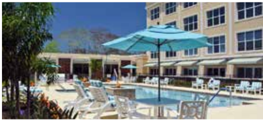
THE MANOR NEIGHBORHOOD