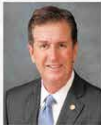
Special Speaker: FL State Senator Jim Boyd