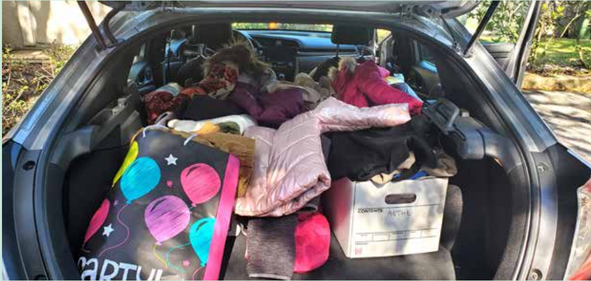
Coats & clothing collected for Turning Points