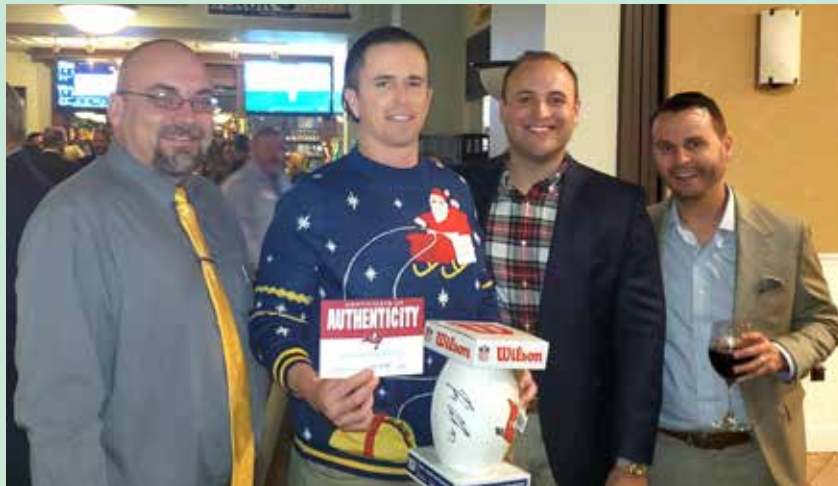
Getting ready to raffle the “Gronk Football”