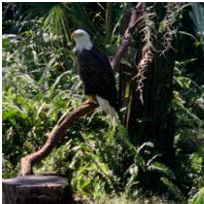
Bald Eagle at Lowry Park Zoo

My family and I are doing great. We are adjusting to the new normal. This mainly means wearing masks in school all day long for the kids. Baseball started back up in June and my son is on the big field for the first time! As a sign of the times, my family went to the Lowry Park zoo for the first time in years. The wonderful bald eagle is still there, confident as ever. See the attached picture.