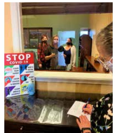
Covid Sign In Procedures at the office

COVID has significantly changed the way we handle things in our office. We worked remotely for 6 weeks and then returned to the office with masks, lots of hand sanitizer and Lysol. We had to completely restructure how we handle our appointments. Zoom meetings and telephone conferences have been our primary way of communicating with clients and we have come up with a system to where we allow one client into the office at a time to sign documents while the witnesses and notary are behind a plexiglass window. Although it has been an adjustment and seems like we have 5 steps to handle things that used to only require 1, our goal remains to ensure the health and safety of our staff and clients at all times. We are hopeful that we will be able to return to some type of normalcy soon!