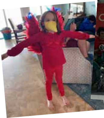
"Anna the parrot" for Halloween