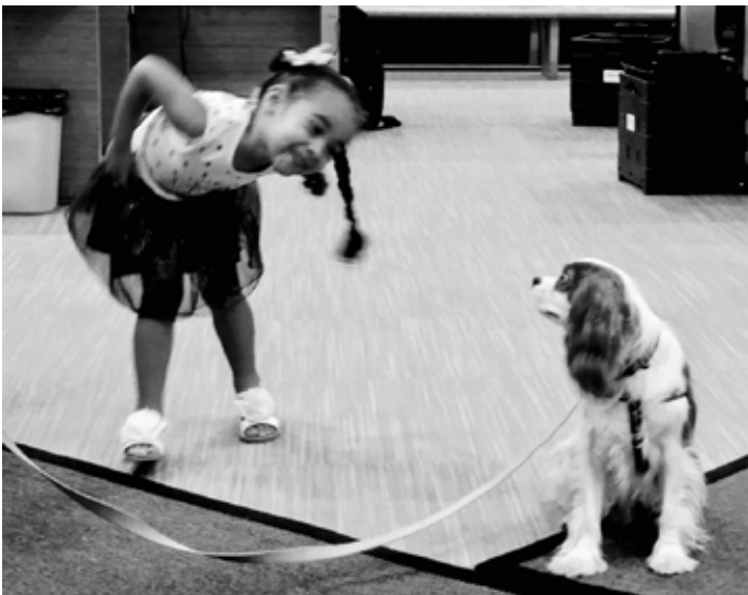
Scout, a 12th Judicial Circuit Therapy Dog, with a friend in court.