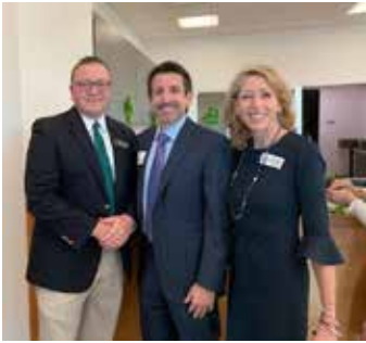
Java with the Judges