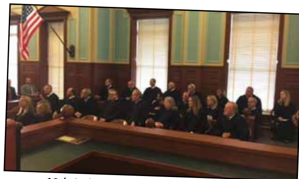
12th Judicial Circuit Judges in Attendance