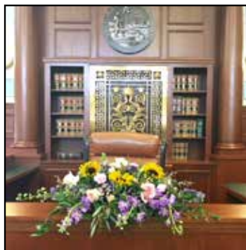
Floral Display presented on behalf of the MCBA membership