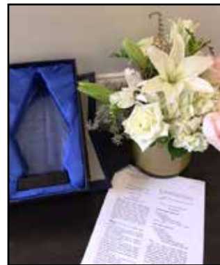
2015 Excellence in Florida Judicial Writing Award presented to Appellate Concurring or Dissenting Opinion Category

Choose the right school and put your kid on a roll from the start.