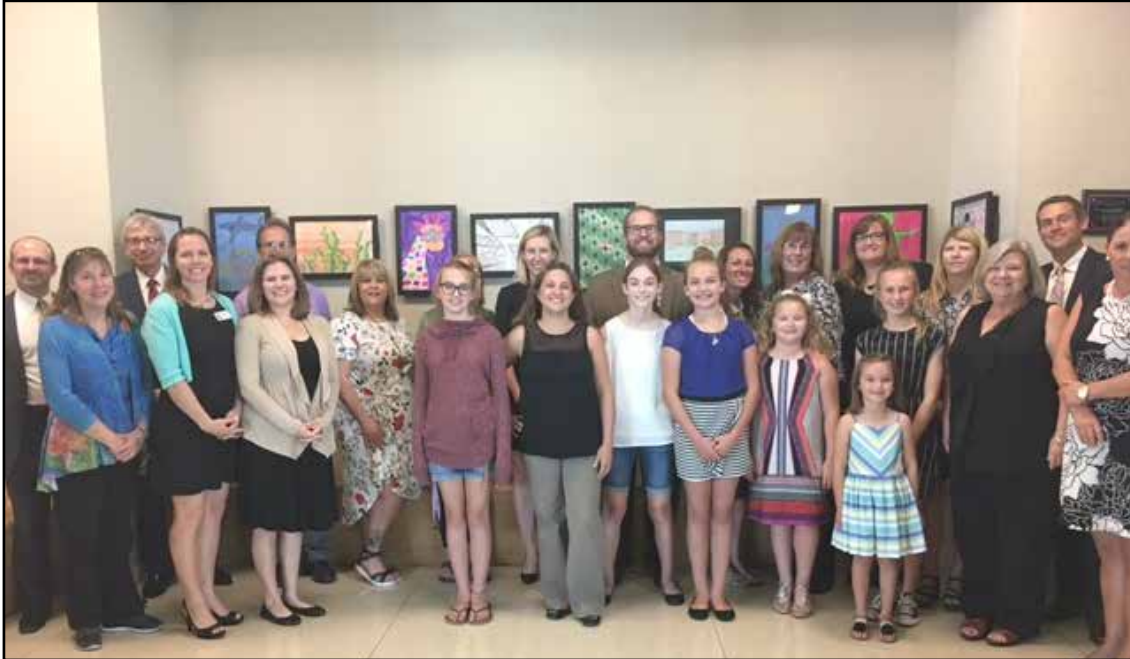
Student Artists, Teachers, Family and Friends

The YLD was delighted to host Manatee County students, their families, and teachers in a special reception on April 4th. The fifth floor of the Judicial Center came alive with merriment and light refreshments as attendees enjoyed various works of art and discussions with the student artists. If you have an extra few minutes, we highly encourage you to visit the art display on the fifth floor.