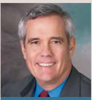
25 YEARS EXPERIENCE