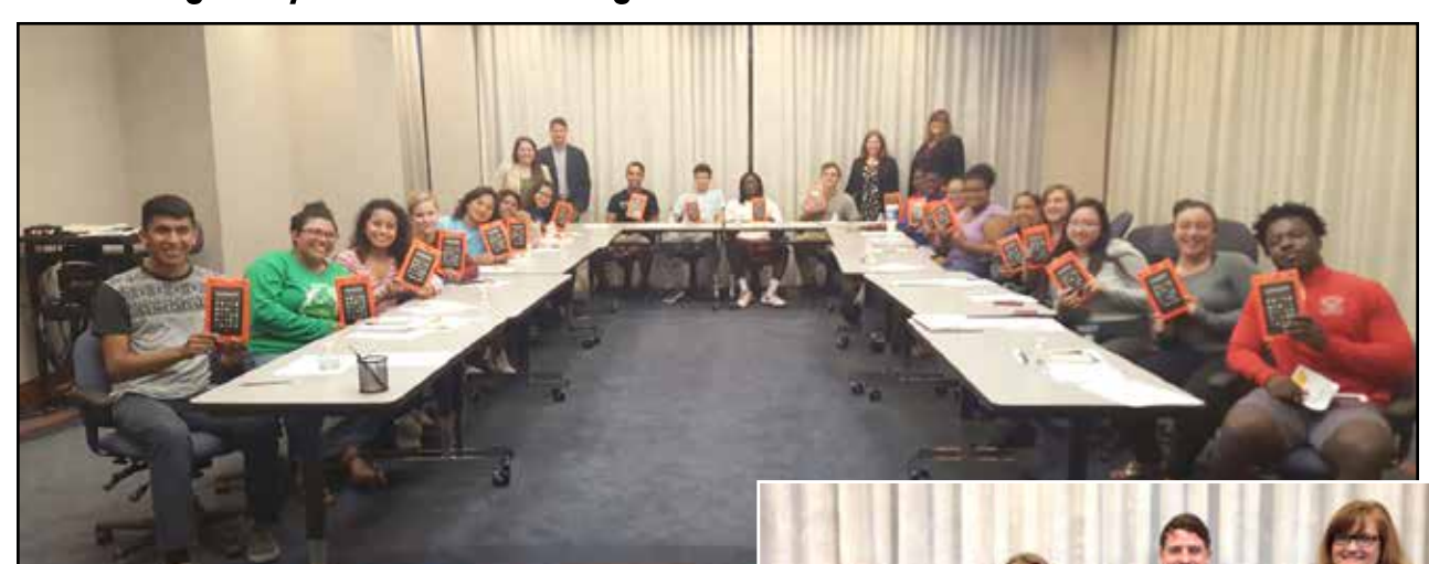
Student Recipients and YLD Presenters

The Young Lawyers Division of the Manatee County Bar Association (Manatee County YLD) participated in a Young Professionals Round Table discussion with the Take Stock Manatee Seniors, where each lawyer shared their personal educational journey with the students. After a 40 minute discussion, the group presented each senior with the Amazon Fire tablet gifts to an overwhelmed and grateful group of students, several of whom were so touched by the generosity of the Manatee County YLD that they were moved to tears.