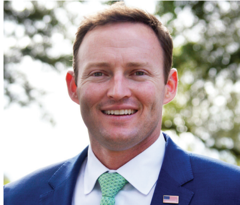
Florida Congressman Patrick Murphy Democratic Candidate for the U.S. Senate