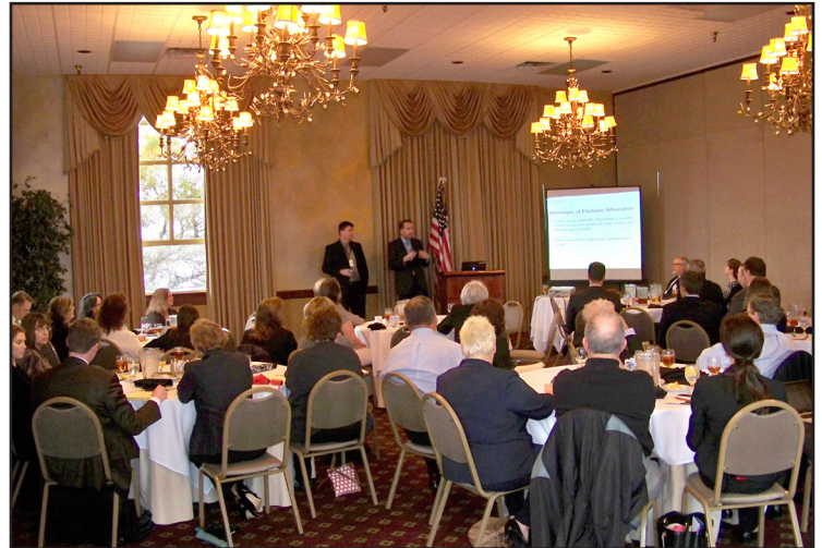
No presentation pitfalls here... attendees remarked about the quality of the seminar, specifically the engaging presentation that had no trouble keeping attorneys' attention. Substantive topics covered a variety of technology related issues.